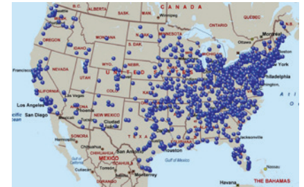
2012 – 2013 School Map

If you are unable to locate a school, please contact the Collision Repair Education Foundation for a list of schools in your area.